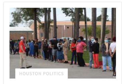
BY ZACH DESPART, STAFF WRITER

How you can avoid the long voting lines around Harris County