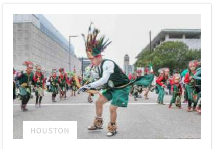
BY ZACH DESPART, STAFF WRITER

How you can avoid the long voting lines around Harris County